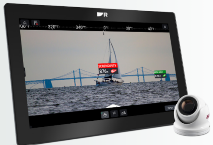
Augmented Reality with CAM300 and AR200 sensor